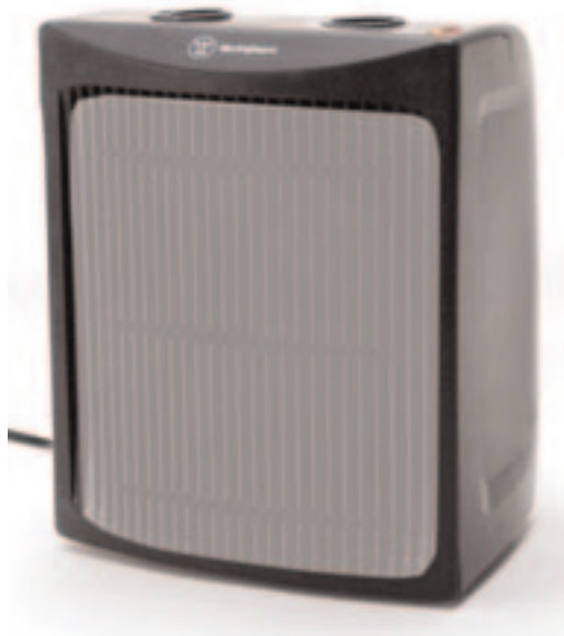
WST6004 Upright Heater