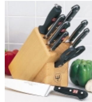
Counter Top Blocks