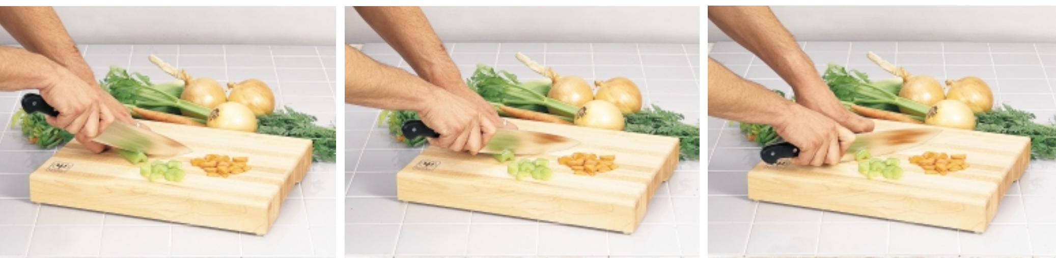
The knife itself is kept in a perpetual push/down & forward, pull/up & back "rocking" motion as the opposite hand skillfully "feeds" the food through the cutting "zone."

There is a certain sense of satisfaction to be gained when one has mastered the use of any professional quality tool. The cook's knife is no exception. There really is no secret!