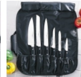
Rolls & Attaches