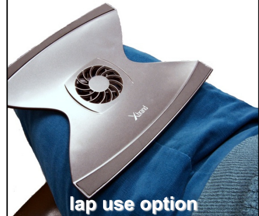
lap use option