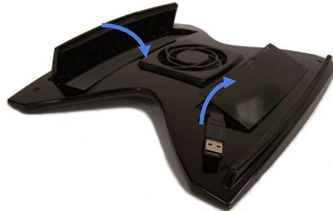
collapses for transport