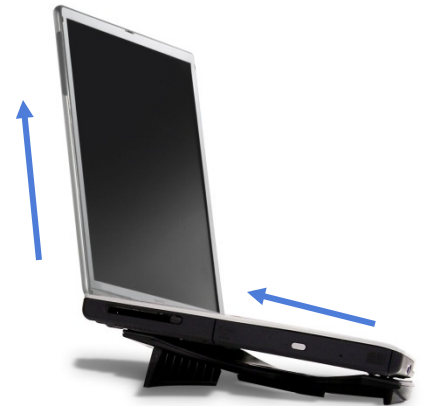
improves screen height & typing angle