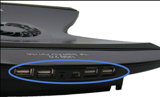
USB 2.0 Hub

integrated 11 blade desktop quality cooling fan delivers superior cooling capacity