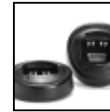
Rapid-rate Desktop Charger