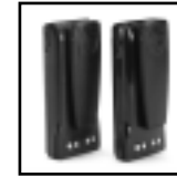
Battery & Belt Clip