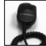
Remote Speaker Microphone