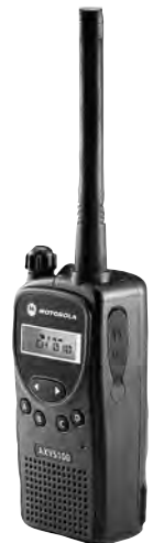
Dimensions: 4.5"H x 2.2"W x 1.81"D, Weight w/battery 11.5 oz., Color: Black