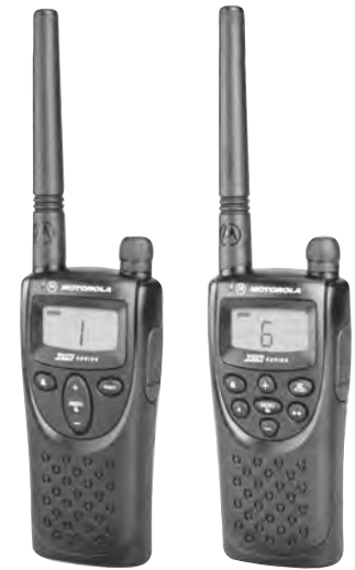
Dimensions: 5.1"H x 2.5"W x 1.38" D, Weight w/battery 9.9 oz., Color: Black