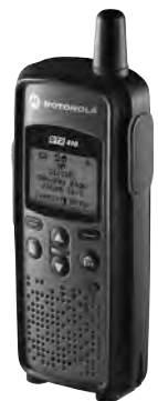
Dimensions: 5.2"H x 2.3"W x 1.4"D, Weight w/battery 7.3 oz., Color: Black