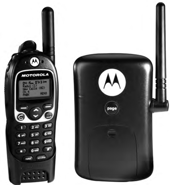
Handset Dimensions: 5.3"H x 2.1"W x 1.3"D Weight w/battery 7 oz., Color: Black