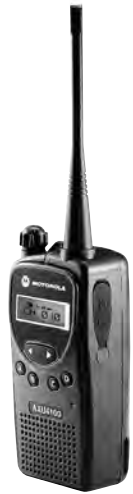
Dimensions: 4.5"H x 2.2"W x 1.81"D, Weight w/battery 11.5 oz., Color: Black