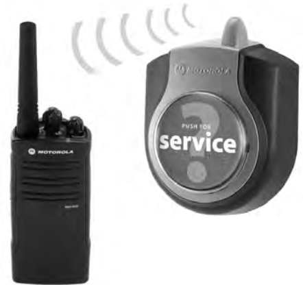
"Assistance needed at the Loading Dock"

The Wireless Message Alert uses business UHF / VHF frequencies and is compatible with most Motorola and other business Walkie-Talkies. It is low cost, completely wireless and battery powered.