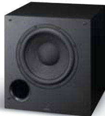
S-W501 10" Powered Subwoofer (Speaker grille included)