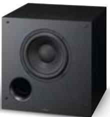
S-W301 8" Powered Subwoofer (Speaker grille included)

The added authority of three powered subwoofers perfectly complement audio and video systems built around the Pioneer and Pioneer CST series speakers.