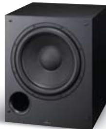
S-W601 12" Powered Subwoofer (Speaker grille included)