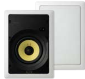
S-IW671-LR 6 1/2" In-Wall CST Speaker

Equipped with the latest CST driver technology and materials inspired by our reference-class platforms, the Elite line is designed to complete the lossless, full definition home theater experience. A three-way in-wall, along with two angled in-ceiling LCR models, offer even greater flexibility for high performance installations.