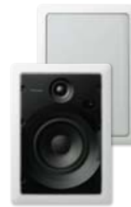
S-IW631-LR 6 1/2" In-Wall Speaker

These models offer a range of application solutions that challenge industry convention with benchmark entry-level performance and build quality, expanding the entertainment experience throughout the home.