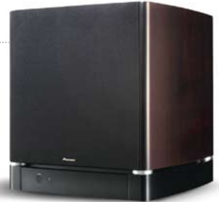
S-W1EX 12" Reference Standard Powered Subwoofer