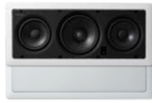
S-IW551L 5 1/4" In-Wall CST LCR Speaker