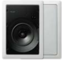
S-IW651-LR 6 1/2" In-Wall CST Speaker

For home theater or multiroom applications that demand performance superior to pivoting driver designs, Pioneer CST speakers offer an affordable experience based upon our acclaimed driver technology.