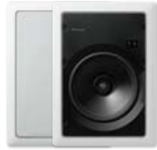
S-IW851-LR 8" In-Wall CST Speaker