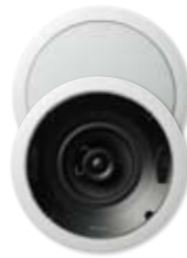
S-IC631-LR 6 1/2" In-Ceiling Speaker