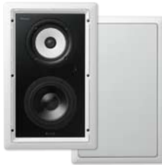
S-IW691 6 1/2" Reference Standard In-Wall CST Speaker

Based on the award-winning EX platform, Pioneer introduces a reference-class system that redefines the architectural speaker category. The Elite EX Series is specifically designed to deliver the most faithful reproduction in dedicated home cinema and two-channel systems for critical listeners who revel in pristine performances and ultimate fidelity.