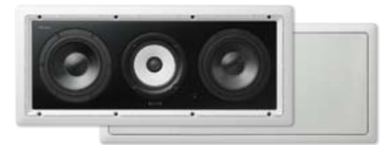
S-IW691L 6 1/2" Reference Standard In-Wall CST LCR Speaker