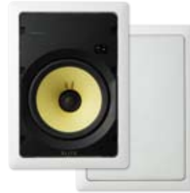
S-IW871-LR 8" In-Wall CST Speaker