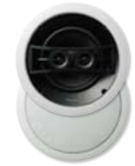
S-IC821D 8" In-Ceiling Dual Voice Coil Speaker