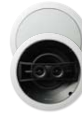
S-IC621D 6 1/2" In-Ceiling Dual Voice Coil Speaker