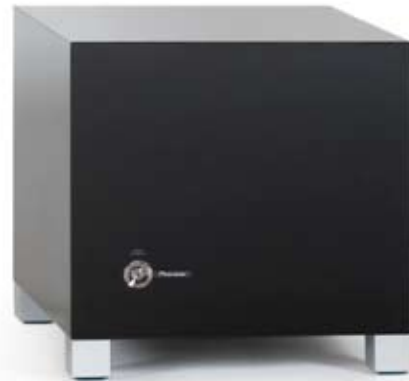
S-LX70-W 12" Compact Powered Subwoofer with Gloss Black Finish