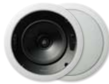
S-IC851-LR 8" In-Ceiling CST Speaker