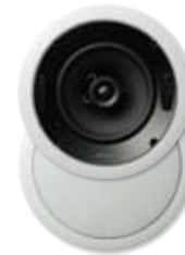
S-IC831-LR 8" In-Ceiling Speaker