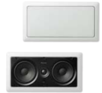
S-IW531L 5 1/4" In-Wall LCR Speaker