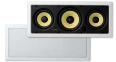
S-IW571L 5 1/4" In-Wall CST LCR Speaker