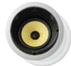
S-IC871A 8" In-Ceiling CST LCR Speaker