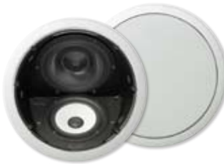
S-IC691A 6 1/2" Reference Standard In-Ceiling CST Speaker