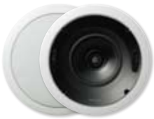
S-IC651-LR 6 1/2" In-Ceiling CST Speaker