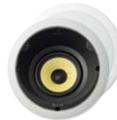
S-IC671A 6 1/2" In-Ceiling CST LCR Speaker