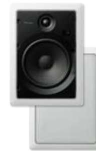
S-IW831-LR 8" In-Wall Speaker