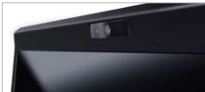
Integrated webcam: get video conferencing on the go