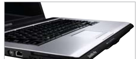
Mobile style: set the trend with this unique notebook design

Toshiba EasyGuard Carefree Mobile Computing