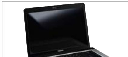
15.4" Toshiba TruBrite® widescreen display: for brighter images and more productivity