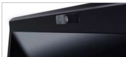
Integrated webcam: get video conferencing on the go