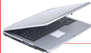
The A50 series