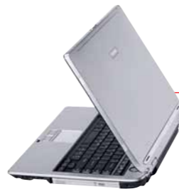
The M30 series