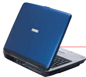
The A60 series