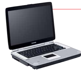
The P10 series