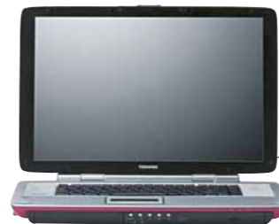
The P20 series