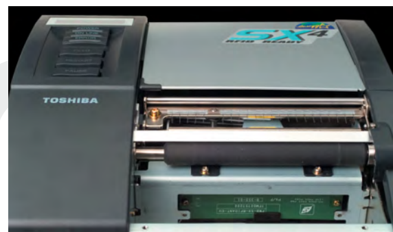
UHF RFID Antenna