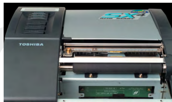
UHF RFID Antenna

Fast, reliable, easy and compatible at a lower total cost of ownership