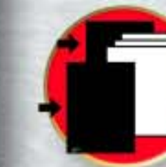
POST INSERTION FEATURE

easy way to configure, operate, and monitor the e-STUDIO810 directly from their desktops. The TopAccess™ utility provides Internet browser-based job queue observation abilities.