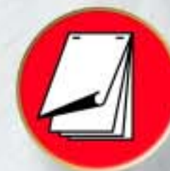
MULTI-POSITION STAPLING FINISHER

Multi-platform Client/Server Management Software gives network administrators an