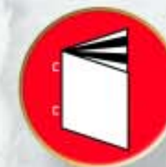
MULTI-POSITION STAPLING FINISHER WITH SADDLE-STITCH