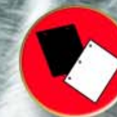
2 & 3 HOLE PUNCH