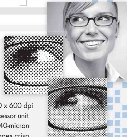
Superior image quality

Speed is only valuable when the product remains high-quality. That's why Toshiba ensures image quality with a crisp, clear 2400 x 600 dpi using an advanced image processor unit. Ultra-fine 8-micron toner and 40-micron developer also help keep images crisp, offering exceptionally fine resolution. An 8-bit monochrome scanner produces precise grayscales while sharpening onscreen images.