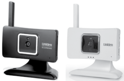
GC43 or GC43W (White) camera (1)