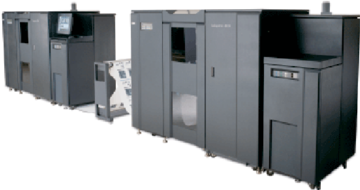
Figure 45. Infoprint 4100-HD1/HD2 and 4100-PD1/PD2 Printers

Table 139 summarizes the printer characteristics for the Infoprint 4100-HD1/HD2 and 4100-PD1/PD2 printers.