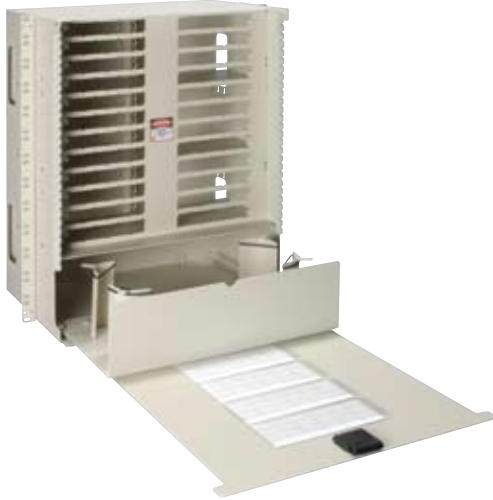
144-Position Termination/Splice Panel

Limited floor space often dictates that multiple pieces of communications apparatus share common equipment racks. The FL1000 panel is an economical solution with fundamental cable management features.