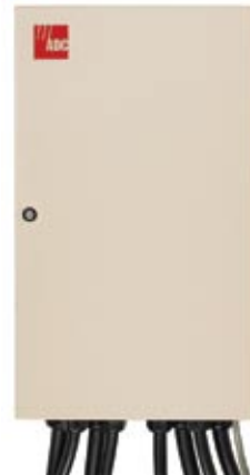
NCX-1000s enables centralized broadband service delivery from CoolPed cabinets.