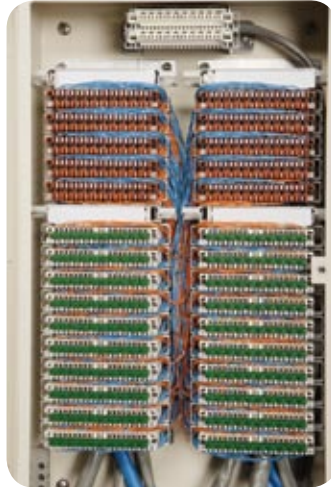
Green activation plugs in cross-connect distribution field provide visual indication of active xDSL customers.

The high performance LSA-PLUS Series 2 IDC blocks are far superior to standard 66- and 110-type IDC blocks. Contacts angled at 45 degrees offer a larger, stronger cross section of wire and a gas tight seal. Silver-plated contacts resist corrosion much more effectively than standard tin-plated contacts. Combined with integral clamping ribs for extraordinary grip, LSA-PLUS blocks offer exceptional electrical performance and contribute to reduced failure frequency rates in the network.