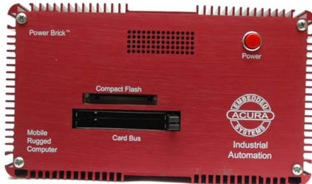
Figure2.1: Front side of PowerBrick-CV.

In order to get familiar with your system before mounting it at your vehicle (or final location), we suggest you look at the connections on both ends of the computer such as shown in Figs. 2.2 and 2.3, connect up the unit, and place it into operation.