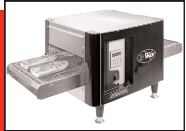
X*WAV™ 1422 EZ SS PASS THROUGH CONVEYOR TOASTER

*Times depend on crust thickness- Thawed pizza only