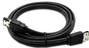
eSATA Cable x2