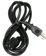
Power Cord (U.S. Version Shown)

WARNING: Please remember to set the power supply to your local outlet voltage prior to plugging in the power cord. Failure to do so may damage the power supply.