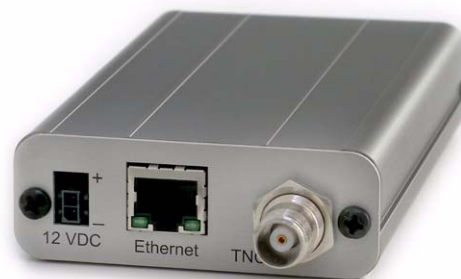
FIGURE 1. Raven-E back