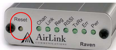
FIGURE 7. Reset button

The Raven-E should now register on the network.