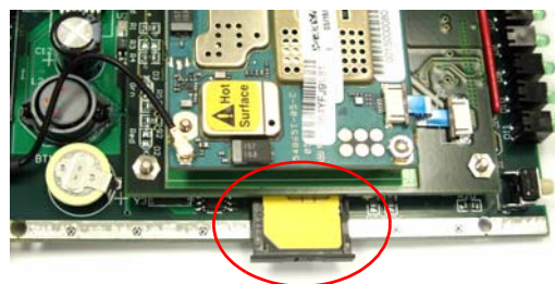
FIGURE 5. Inserting the SIM: Raven-E