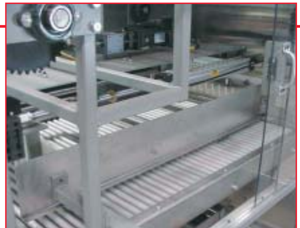
Smooth Servo Drives for Turntable, Product Pusher, and Loader Belt enhance Operation and extra Life of Components

154" X 76" X 58" (3910 mm X 1930 mm X 1470 mm)