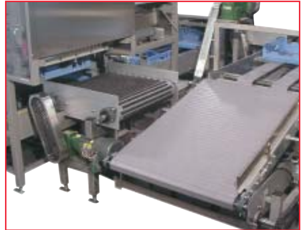
Discharge Conveyor with Kicker Conveyor

Contact your AMF representative for more information about our complete line of: