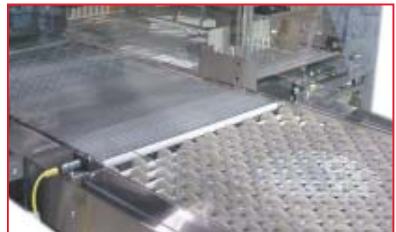
Pattern Staging and Loading Area