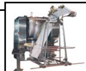
Optional Dough Elevator Showing Swing Away Feature