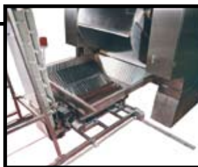
Optional Lateral Traveling System