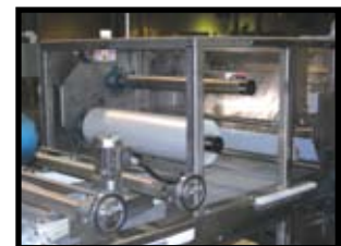
Pneumatic Film Roll Arms