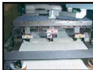
Above Belt Side Seal and Center Seal