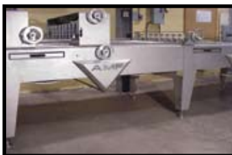
Clear Under Frame Design