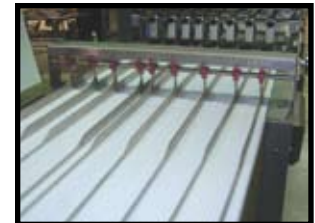
Adjustable Lane Guide System