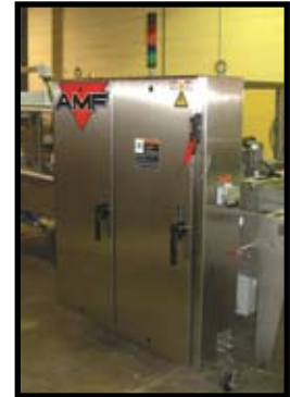
Machine Mounted Electrical Panel