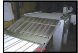
Accumulation Conveyor and Slide