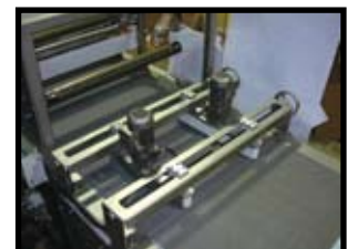
Driven Side Belt Regrouper