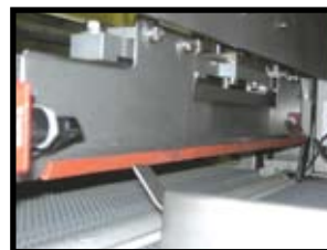
One Piece Knife and Seal System