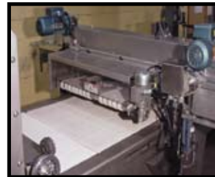
Dual Band Slicer