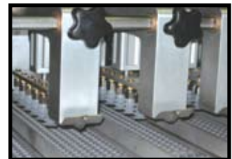
Collapsing Cup Grouping Gate