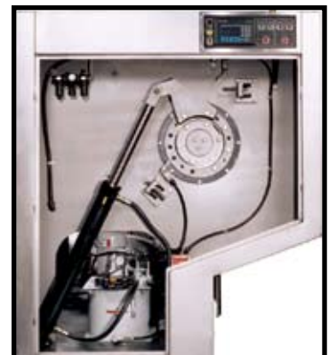
Hydraulic Tilt Mechanism Side With Special Operator Controls