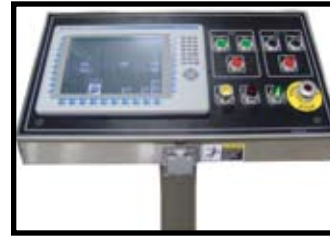
Optional Remote Pedestal Operator Console with Dough Quality Monitoring System