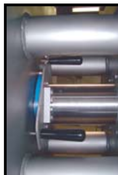
Sanitary Main Shaft Seal