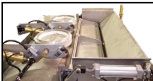
Mixer Top Canopy With Multiple Flour Inlets and Sponge Door