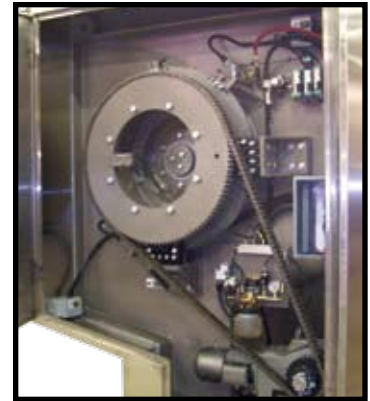
Mechanical Tilt Mechanism Side