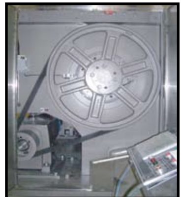
Agitator Drive Side