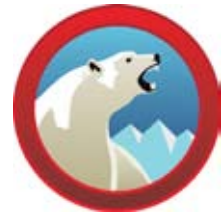
Arctic Cooling Package