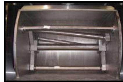
Optional Y-T Agitator