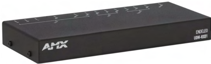
FIG. 1 UDM-RX01

Installed at the display device, the UDM-RX01 (FG-UDM-RX01) converts the signal received from a UDM Multi-Format Distribution Hub to standard A/V signals (FIG. 1).