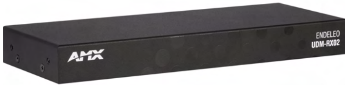
FIG. 1 UDM-RX02

Installed at the display device, the UDM-RX02 (FG-UDM-RX02) converts the signal received from a UDM Multi-Format Distribution Hub to standard A/V signals (FIG. 1).