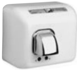
DR-TN Series White, Automatic