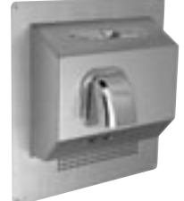
DR-TNSSR Series Stainless Steel, Automatic, Recessed

The DR series push button and automatic hand and hair dryers offer exceptional construction, durability and performance. Our best selling series comes standard with a 10-year limited warranty. Options include a stainless steel cover with satin finish, a fixed nozzle and recessed mounting.