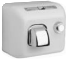
DR-N, DR-NH Series White, Push Button