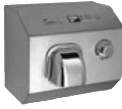
DR-NSS, DR-NHSS Stainless Steel, Push Button