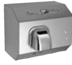
DR-TNSS Series Stainless Steel, Automatic