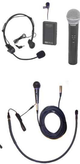
B9153 Premium Wireless Package