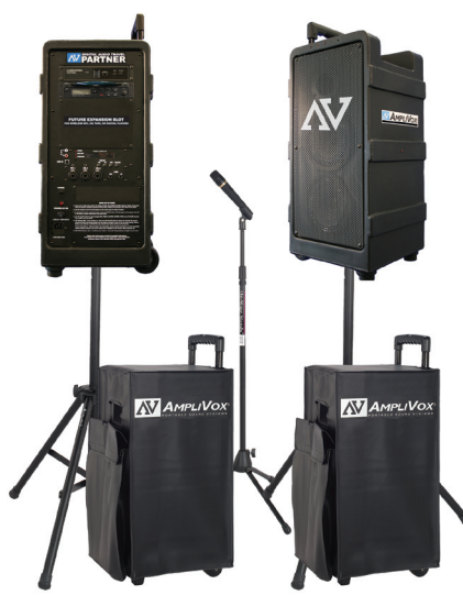
B9154 Platinum Wireless Package