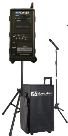
B9151 Basic Wireless Package