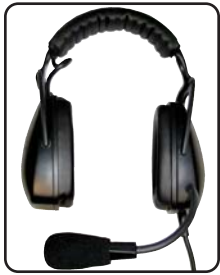
HW-300 - Dual-Earpiece