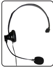
LSW-300 - Light-Weight