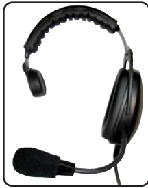
HSW-300 - Single-Earpiece