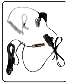
ESW-300 - Concealed

CAUTION: When storing your system in the PortaCom PRO hard case, place each belt pack into its storage slot carefully. Turning the thumb wheel during insertion will turn the power on and drain the battery.