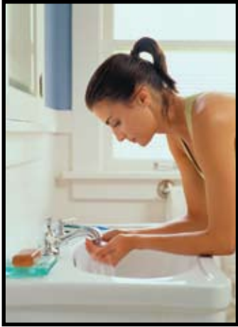
In the bathroom . . .

Enjoy Softened Water Throughout Your Home