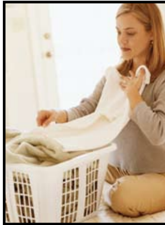
In the laundry . . .

Economical Water Conditioning System SAVES You Money!