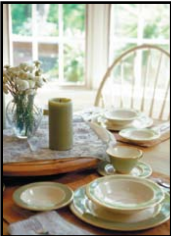
In the kitchen . . .