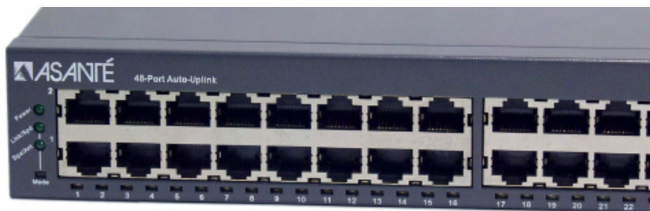
Dual-state status indicators clearly display Link/Speed or Duplex/Activity for each port