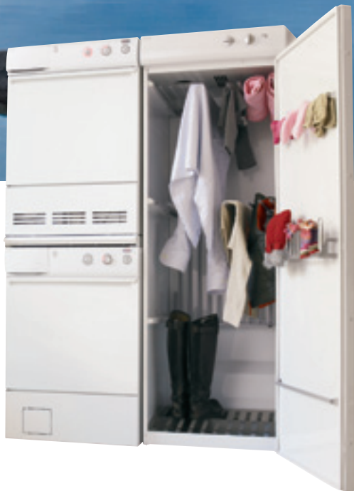
UltraCare Drying Systems Drying Cabinets, Vented & Ventless Dryer