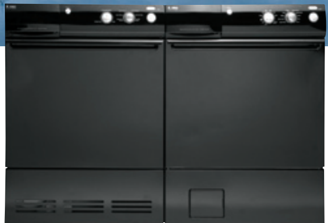
UltraCare Family Laundry System