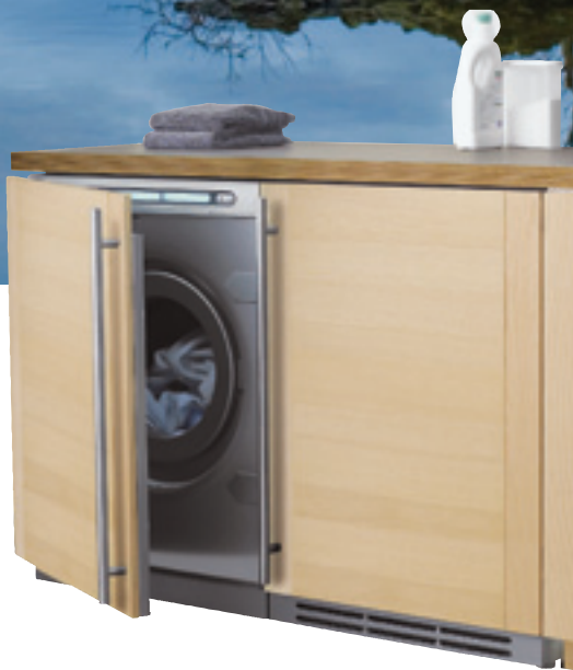
UltraCare Fully Integrated Laundry System