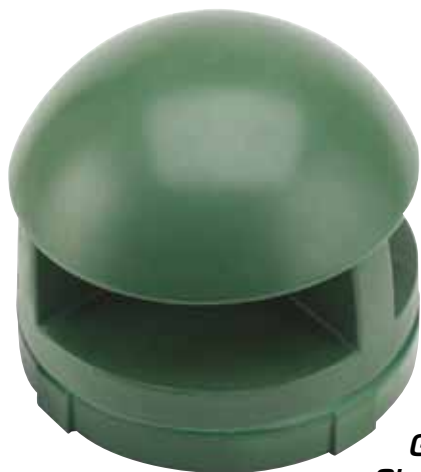
GSS-G Short Base