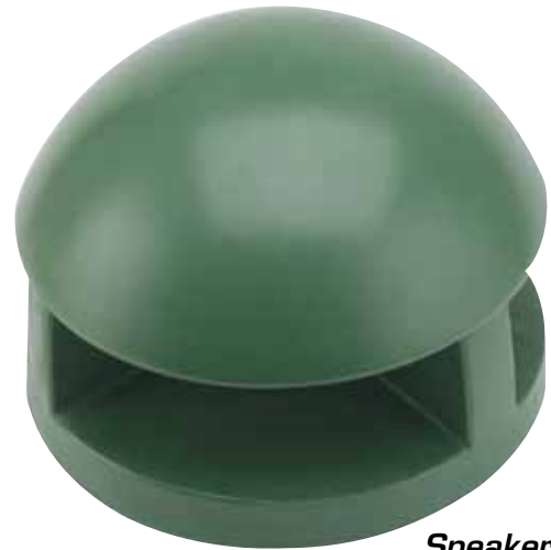
Speaker Head Unit