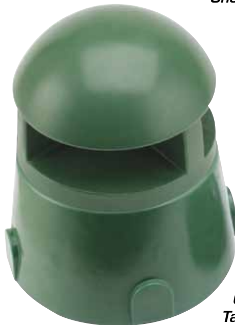
GST-G Tall Base