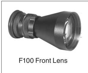
F100 Front Lens

The NVG-7 with F100 front lens can be used as a powerful night vision bi-ocular. To change the front lens unscrew the front lens off the body of the NVG-7 (make sure that the unit is turned off). Screw the F100 lens.