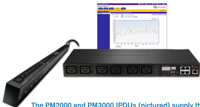
The PM2000 and PM3000 IPDUs (pictured) supply the power a data center needs.

The DSView 3 software provides access and control to nearly all equipment found in today's data centers. The DSView 3 Power Manager extends the capability of the DSView 3 software by also giving companies the ability to monitor and measure IT energy consumption, costs, and trends across all levels within their data centers and remote locations. With the PM2000 & PM3000 IPDUs this information can allow you to look at individual devices, a rack of equipment, a row of equipment and group items together to view overall consumptions, capacity and cost across many locations or just a single device.