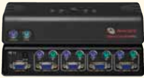
SwitchView PC switch

The Avocent SwitchView PC KVM desktop switches let you control up to four PS/2 computers from one keyboard, monitor and mouse. Lighted LED indicates which computer you are accessing and audible indicators confirm channel switching. With color-coded cables for easy installation, customisable channel selections and error-free boot-up, the SwitchView PC switch offers you a complete desktop KVM solution.