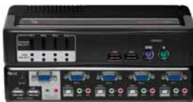
SwitchView Multimedia switch