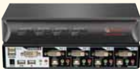
SwitchView DVI switch

The SwitchView DVI (Digital Visual Interface) KVM switches feature 1920 x 1200 video resolution and deliver crisp images for your high-end displays and flat panel monitors. The versatile SwitchView DVI KVM switch is available in 2 and 4-port models. It easily manages up to four USB DVI computers from a single USB keyboard, mouse and DVI monitor.