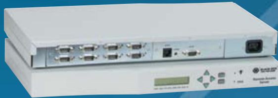
LRA508A-ET-R5: top: rear view; bottom: front view

With the manager software, you can also create and upload configuration files (which, in turn, can be used as a base for any number of servers), download new firmware, and display statistics and event logs. You're also given easy access to self-explanatory configuration and network diagnostic information.