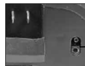
12 VOLT DC CHARGING/POWER PORT