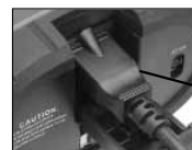
BUILT-IN 120 VOLT AC CHARGER