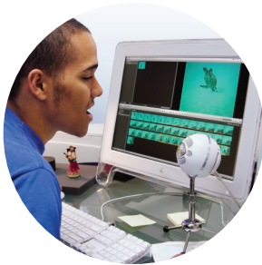
home video voiceover