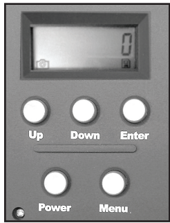
Button & Display Detail