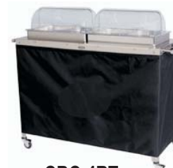
CBC-4RT 4 Pans & 2 Rolltop Lids

CBC-2RT, CBC-3RT: 300 Watts / 2.5 amps / 120 Volts / 60 Hz 1 Temperature Control (active heat area: 22-1/8" x 15")