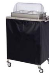
CBC-2RT 2 Pans & 1 Rolltop Lid

Models: CBC-5RT, CBC-4RT, CBC-3RT, CBC-2RT