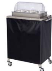
CBC-3RT 3 Pans & 1 Rolltop Lid