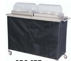
CBC-5RT 5 Pans & 2 Rolltop Lids