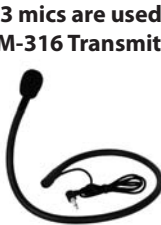
CM-316 Collar Mic