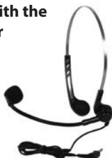
HBM-316 Headband Mic