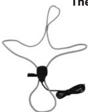
LM-316 Lapel Mic

These 3 mics are used with the M-316 Transmitter