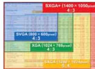
Size comparison: SXGA+ and others

To match the increasing demand for high resolution display technology, the REALiS SX50 features native SXGA+ resolution – perfect for displaying crisp video, photographs, fine text, spreadsheets, CAD drawings, and engineering diagrams. Compared to mainstream projectors that offer XGA resolution (1024 x 768), the REALiS SX50 features SXGA+ resolution (1400 x 1050), for an expanded display range, capable of reproducing even the smallest details with razor sharp precision. SXGA+ can also display true 16:9 high definition broadcast images.