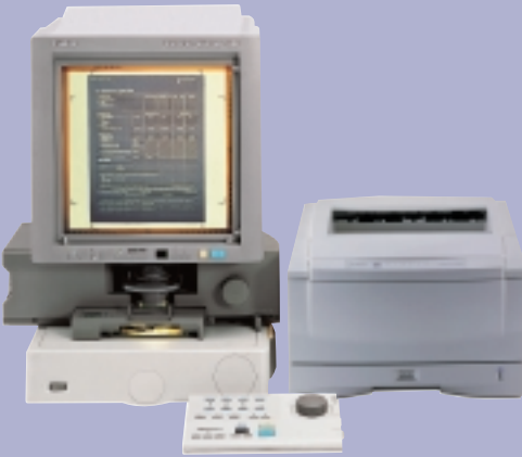
MICROFILM SCANNER 500 WITH THE FILEPRINT 400