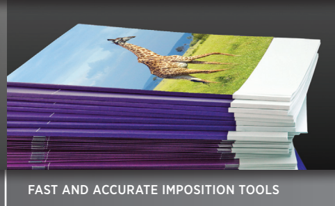
FAST AND ACCURATE IMPOSITION TOOLS