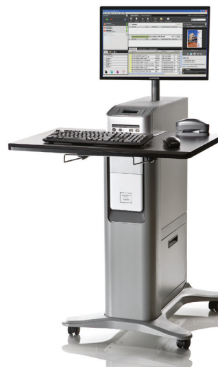
EFI Fiery Integrated Workstation