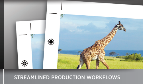
STREAMLINED PRODUCTION WORKFLOWS