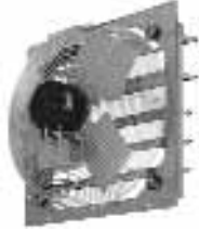
SEF SHUTTER MOUNT FAN

READ AND SAVE THESE INSTRUCTIONS FOR FUTURE REFERENCE