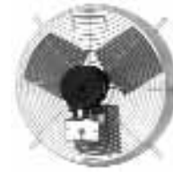
GEF GUARD MOUNT FAN

CAUTION! THESE FANS ARE DESIGNED FOR GENERAL VENTILATION USE ONLY. DO NOT USE TO EXHAUST CORROSIVE, HAZARDOUS OR EXPLOSIVE MATERIALS AND VAPORS.