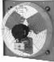
PEF PANEL MOUNT FAN