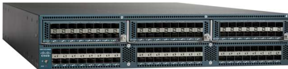
Figure 4. Cisco UCS 6296UP 96-Port Fabric Interconnect

The Cisco UCS 6296UP 96-Port Fabric Interconnect (Figure 4) is a 2RU 10 Gigabit Ethernet, FCoE and native Fibre Channel switch offering up to 1920-Gbps throughput and up to 96 ports. The switch has 48 1/10-Gbps fixed Ethernet, FCoE and Fiber Channel ports and three expansion slots.