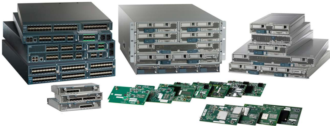
Figure 2. Cisco UCS 6200 Series Fabric Interconnects

From a networking perspective, the Cisco UCS 6200 Series uses a cut-through architecture, supporting deterministic, low-latency, line-rate 10 Gigabit Ethernet on all ports, switching capacity of 2 terabits (Tb), and 320-Gbps bandwidth per chassis, independent of packet size and enabled services. The product family supports Cisco® low-latency, lossless 10 Gigabit Ethernet 1 unified network fabric capabilities, which increase the reliability, efficiency, and scalability of Ethernet networks. The fabric interconnect supports multiple traffic classes over a lossless Ethernet fabric from the blade through the interconnect. Significant TCO savings come from an FCoE-optimized server design in which network interface cards (NICs), host bus adapters (HBAs), cables, and switches can be consolidated.