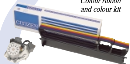
Colour ribbon and colour kit