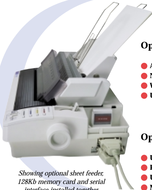
Showing optional sheet feeder, 128Kb memory card and serial interface installed together