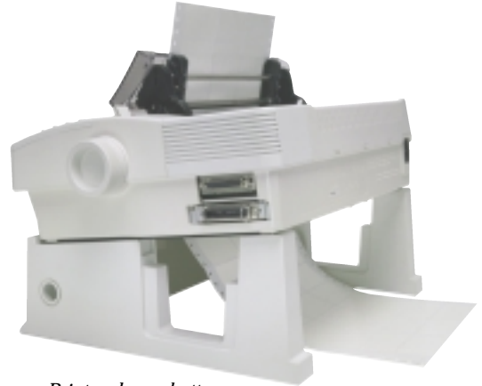
Printer shown bottom feeding labels on the optional printer stand