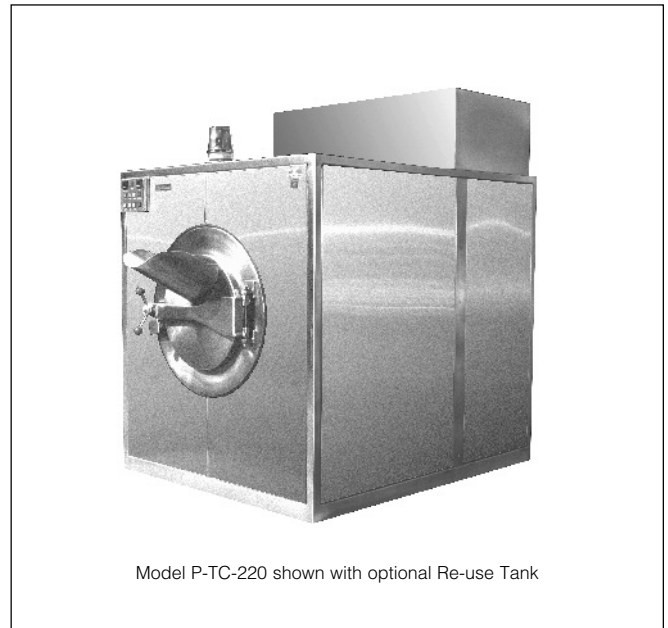
Model P-TC-220 shown with optional Re-use Tank